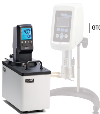
GT0908 Water bath digital up to 200 °C.