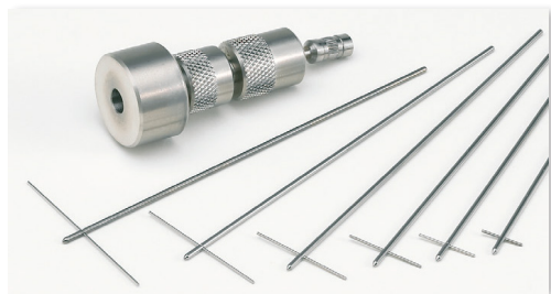
CODE . . . . . GT0916 6 T-bar spindles set.

Note: LV-2C, LV-3C, LV-5, RV/HA/HB-1 are spindles available as on option. The others are supply with the relative viscometer.