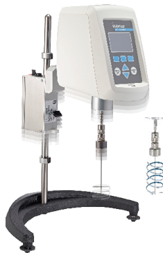
CODE . . . . . GT0910 MODEL . . . . . Model D helical trajectories