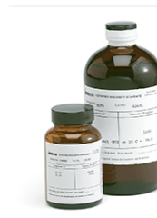
GT0917 Viscosity standard liquid