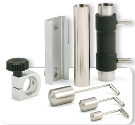
CODE . . . . . GT0914 MODEL . . . . . DIN adapter