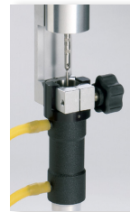
CODE . . . . . GT0913 MODEL . . . . . UL adapter