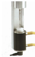
CODE . . . . . GT0912 MODEL . . . . . Small sample adapter